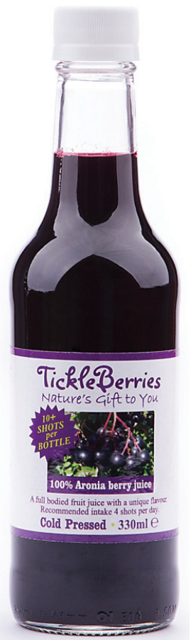
1500 bottles of aronia juice were produced and sold in 2014 with confident forecasts of 6000 bottles in 2015.

"I am genuinely pleased with our progress to date. The plants have grown well and look healthy, our juice is selling on the internet and we are flexible enough to adapt to the challenges in front of us," concluded Andrew. ◆