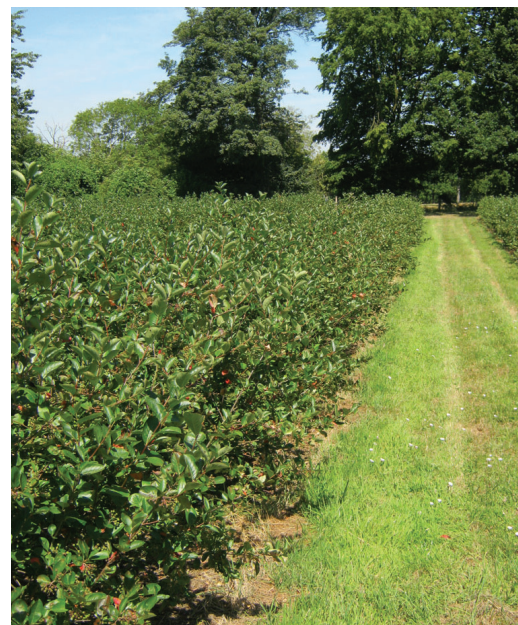
Aronia berry bushes can grow to two metres and more, in both height and width.

The berries grow in clusters and have been compared to cranberries, blueberries and blackcurrants. Their taste is extremely sharp and very