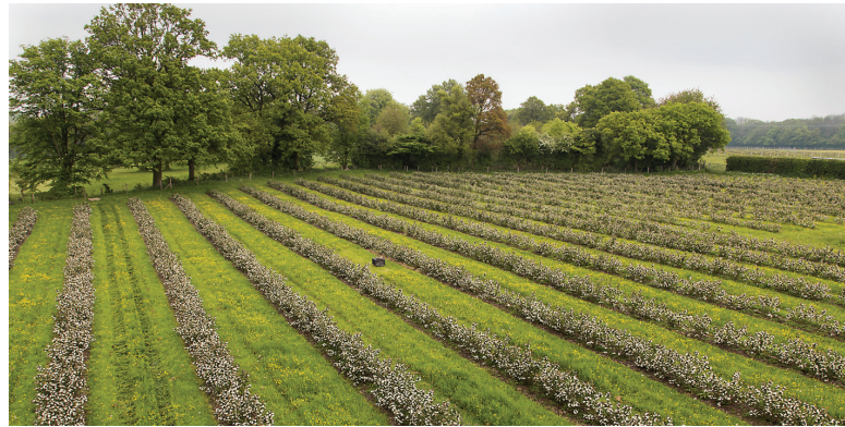
By 2012 every single one of the 2000 plants on a hectare of grade three land at Johnsons Farm had established successfully.

A second planting of another 2000 plants