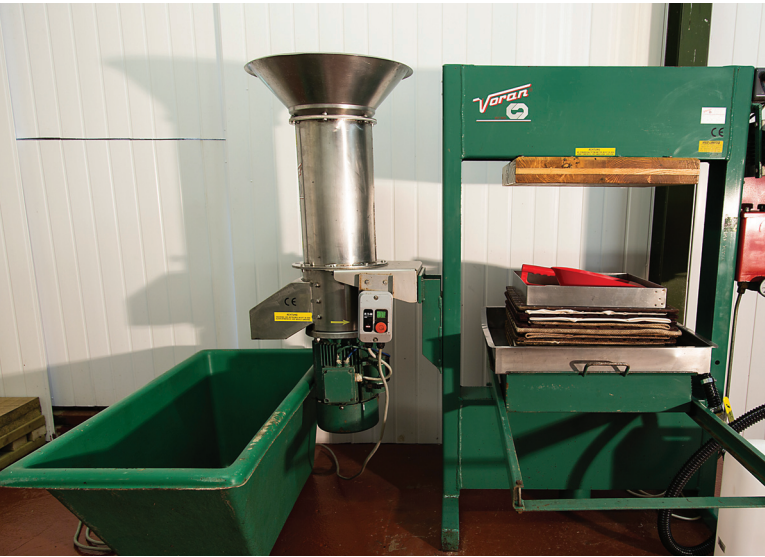
Juicing is undertaken at Johnsons Farm.