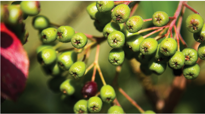
The berries grow in clusters and have been compared to cranberries, blueberries and blackcurrants.