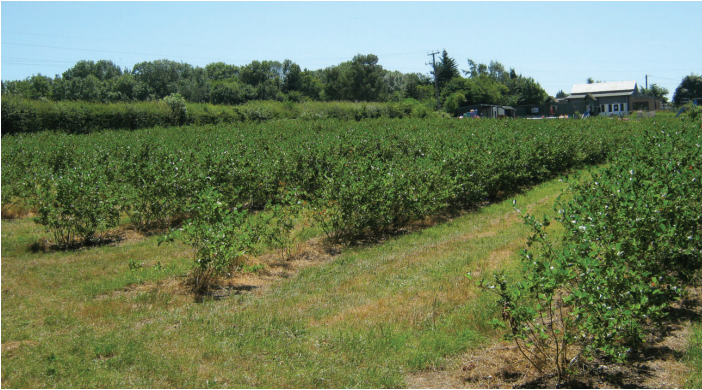
One Aronia berry bush is capable of producing over 13kg of fruit.